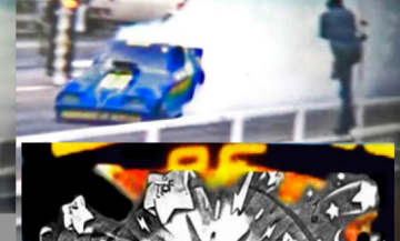
mcSnips from 1978 Steve Clifton film courtesy timetraveldvds